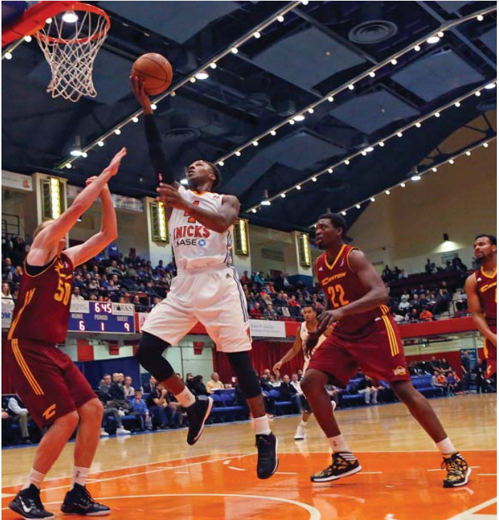
The Westchester Knicks at the County Center (right)