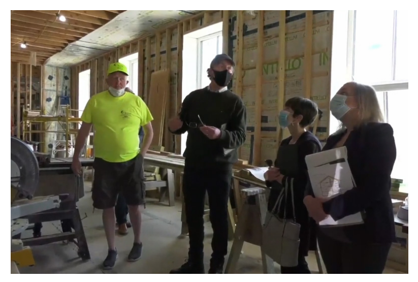
will benefit the future families that call 8 King St. home. It is a model for other homeowners as well. Not only do we see today that it is possible to achieve net zero, we know that homeowners will save significant dollars on their utility bills.