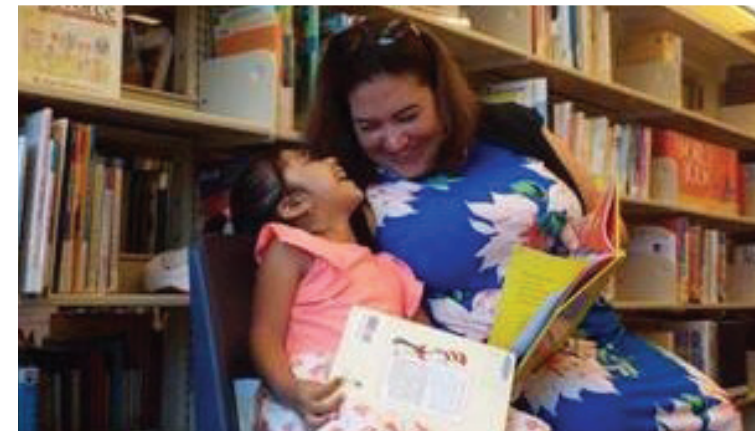
With my Summer Reading Buddy