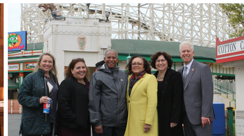
You're never too old to enjoy Playland!