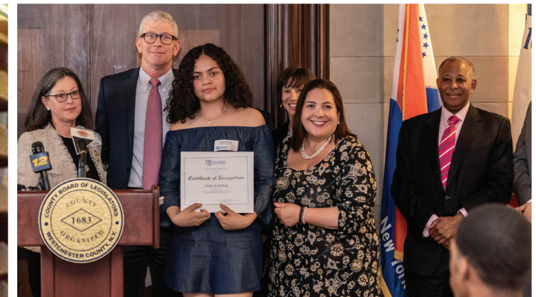
Jandon Scholars 2019