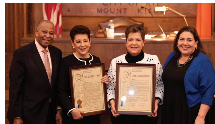
Celebrating Women's History Month