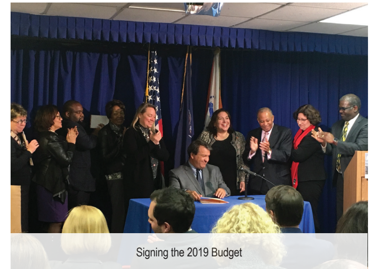
Signing the 2019 Budget

WATCH Hudson Valley News and Views for information about issues, people and programs in our region.