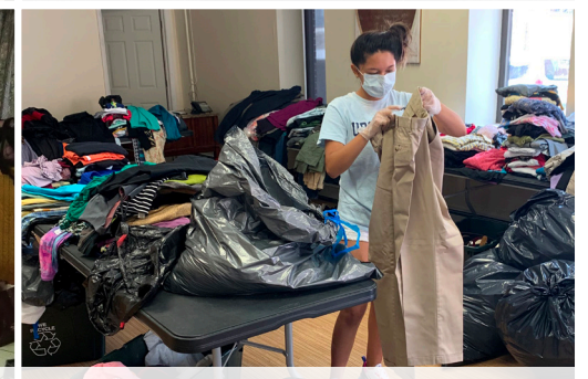
Back to school clothing drive at Eastchester Community Action Program gets a big assist from students of the Ursuline School