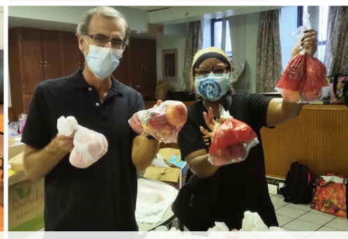
How 'bout those apples and onions and potatoes? Working the window at Bethesda Baptist food pantry in New Rochelle