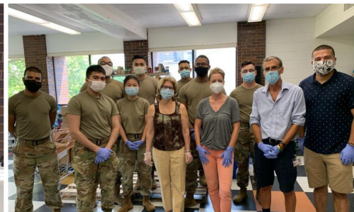
Hats off to the hard working staff, volunteers and National Guard at "95"