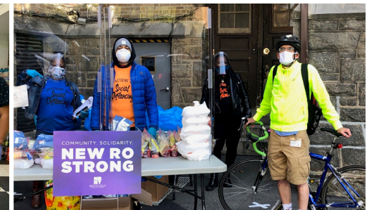
Shiloh Baptist Church in New Rochelle provides breakfast at Hope Community Services.