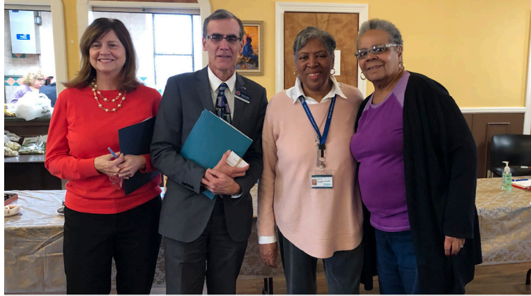
Housing Workshop for Seniors and People with Disabilities at the Tuckahoe Community Center

As the chair of the BOL Labor & Housing Committee, I have made the issue of housing insecurity a top priority. With our partners at Westchester Residential Opportunities, Westhab, Inc., Legal Services of the Hudson Valley, Westchester County Dept. of Planning and Westchester County Depts. of Social Services and Senior Programs and Services, we held a workshop for our seniors and disabled community last fall. Now we are getting information about available eviction prevention, rental assistance and legal help to those negatively impacted by the COVID-19 crisis. On the last page of this newsletter is a list of resources for those in need. ■