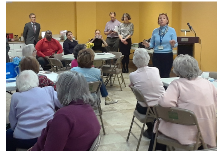
January 2020 transportation seminar for seniors at the Garth Road Senior Center

With the pandemic, my spring meetings with senior groups at Father Fata Hall, Lake Isle, Garth Road and Jackson Avenue had to be postponed. Our planned in person conversations at neighborhood associations this fall have also been delayed. We are happy to set up virtual presentations. Please contact my office at 914-995-4526 for more information.