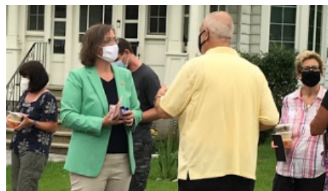
Meeting with residents who were affected by Hurricane Isaias

After Hurricane Isaias, I knew that many of my constituents were facing hard times, especially the Greenwood Road neighborhood. Residents were trapped