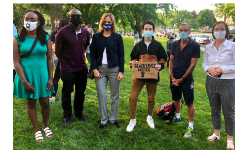
With officials and activists at a Black Lives Matter rally this summer

When our State Legislators began consideration of police reform bills in Albany, I also joined my colleagues in a letter urging changes to state laws, which passed in 2020.