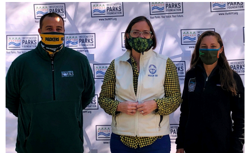
At the Westchester Parks Foundation's Pitch in For Parks Oct 17 event

Our award-winning County Parks system has always been one of the wonderful things about life in Westchester, but this year, with so many families home from work and school, I think we've all gained a new appreciation for just how