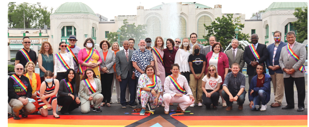
LOFT Westchester organization painting the Pride Flag outside of Playland to celebrate Pride Month