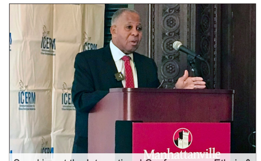
Speaking at the International Conference on Ethnic & Religious Conflict Resolution and Peacebuilding