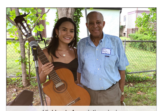
Highlands Association picnic