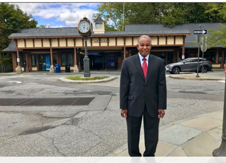
Scarsdale Train Station