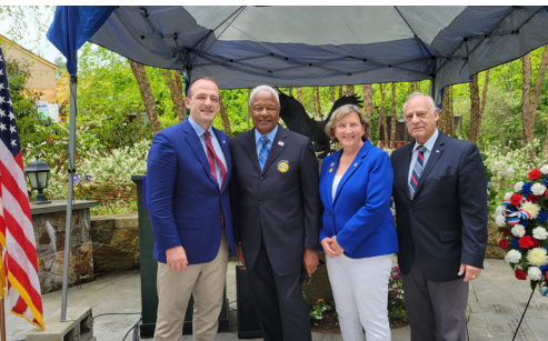
County Memorial Day Ceremony at Lasdon Park