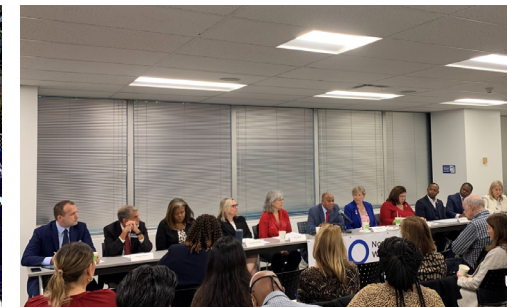
Non Profit Westchester Budget Forum

find other ways to ease the tax burden on residents to provide an easier, less expensive cost of living for all.