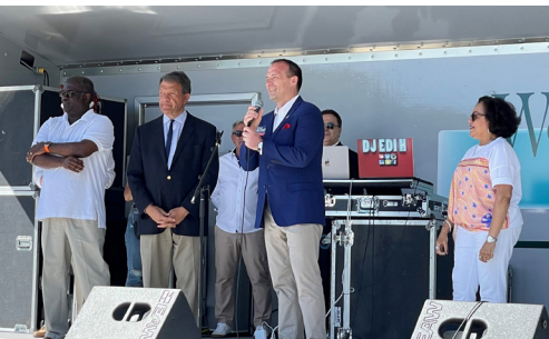
Speaking at the Albanian Heritage Celebration at Kensico Dam

for all County pools as well as Glen Island Beach from July 5 – August 31, 2022. This gave families the opportunity to enjoy County facilities throughout the summer at a considerable savings. ■