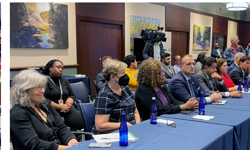
Attending a roundtable with the Attorney General about public safety

Throughout my time on the Board, we have seen a property tax cut each year. I look forward to trying to