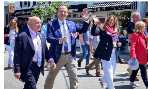
Chappaqua's Memorial Day Parade

SENIOR CITIZENS AND PERSONS WITH DISABILITIES HOME OWNER'S TAX EXEMPTION: This bill will help ease the financial burden on some of our most vulnerable populations: seniors and the disabled community. It will increase the maximum income eligible for New York's property tax exemption to $50,000 for people aged 65 and over and those with disabilities. This is an increase from the previous cap which was $29,000, passed in 2009. With this increase, we will help a larger number of Westchester residents get some much-needed relief. This bill will ensure affordability for seniors, people with disabilities, and those with limited income allowing them to make ends meet. This will also allow those who live on limited incomes to stay in their homes in the communities where they have a network of friends and relatives. Our communities have benefited from having these residents in them. They have spent years dedicating their lives to our communities