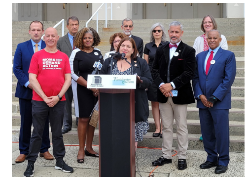
Firearms Warning Label Press Conference

FIREARM WARNING LABELS: I was also the lead sponsor of a firearm warning label law. This law will require gun stores to post signs warning those with access to firearms of the increased risks of suicide, homicide, death during domestic disputes, and the accidental deaths of children or others.