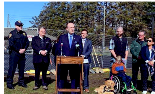
Groundbreaking at Granite Knolls Playground, an inclusive/accessible playground in Yorktown

and now it is time that we help support them. I am very grateful to be the lead sponsor of this bill to decrease the tax burden on some of our most vulnerable populations.