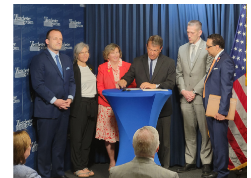
Hate Incidents Bill Signing

REPORTING OF HATE INCIDENTS: Statistics show hate incidents have been on the rise since the coronavirus pandemic started. The majority of these incidents go unaddressed by federal and state laws because they do not rise to the level of criminality. For this reason, the Board passed a law requiring local law enforcement to report all bias-related crimes and incidents. These incidents will be tracked by the Commissioner of Public Safety and the County's Human Rights Commission. ■