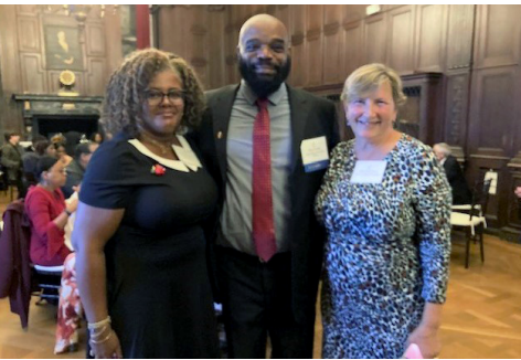
Child Care Council of Westchester, Inc. The Early Education Hall of Heroes on September 30, 2022, at Manhattanville College Redd Castle