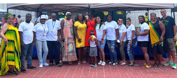
188th Year of Jamaican Emancipation and 60th Anniversary Independence Day Celebration in White Plains