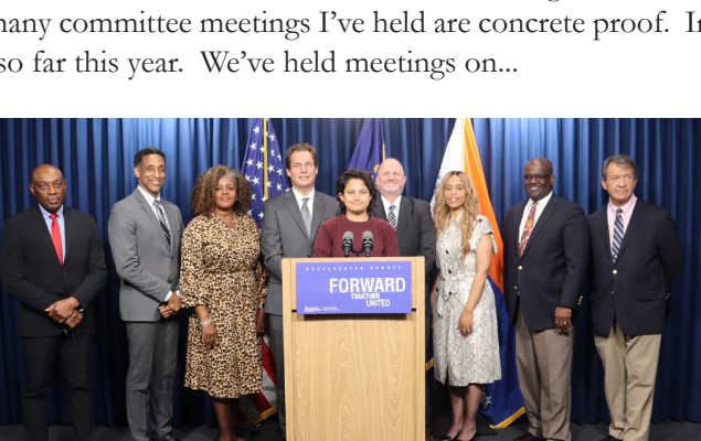
Westchester County Recognizes Month of May as Mental Health Awareness Month