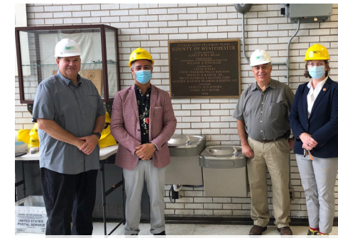
Touring the Yonkers Wastewater Treatment Facility

PEEKSKILL WASTEWATER TREATMENT PLANT: Our commitment to modernization of the Peekskill facility continued