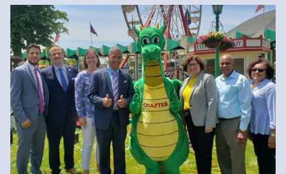
Opening Day 2021 at Rye Playland

GEORGE'S ISLAND PARK: We approved important rehabilitation of structures and services at George's Island Park in Montrose.