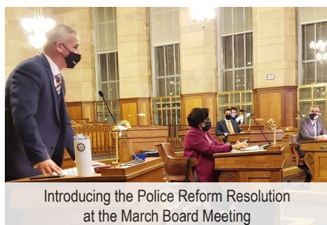
Introducing the Police Reform Resolution at the March Board Meeting