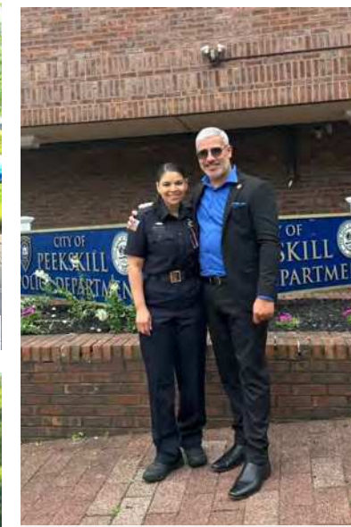
Walk Out Peekskill Police Officer