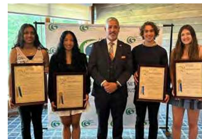
Hudson Valley Gateway Chamber of Commerce Scholarship Breakfast