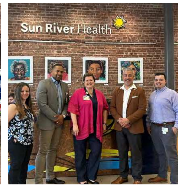
Peekskill Sun River Healthcare Tour