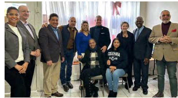
Dominican Community of Hudson Valley Helping Dominicans Obtain Passport IDs