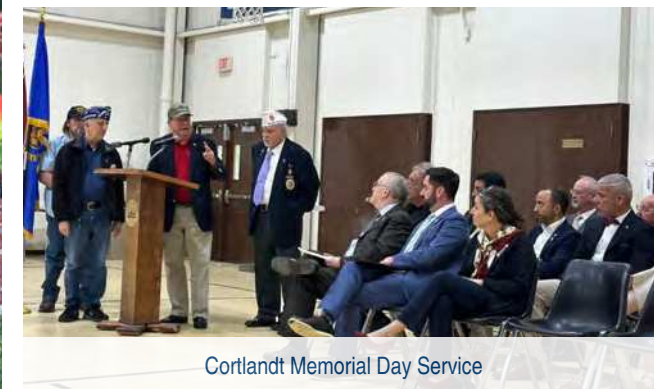
Cortlandt Memorial Day Service