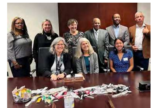
Single-Use Plastic Foodware Committee Meeting

eating implements for take-out food orders when requested.