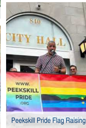
Peekskill Pride Flag Raising