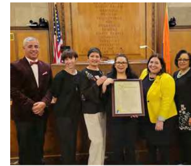
Women's History Month Celebration