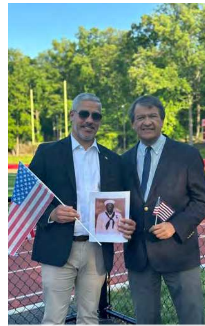
Peekskill Rally for Dorie Miller