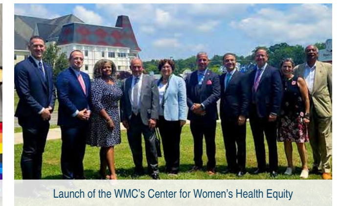
Launch of the WMC's Center for Women's Health Equity