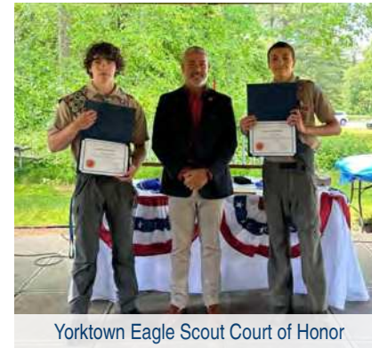
Yorktown Eagle Scout Court of Honor